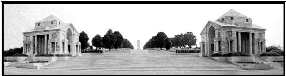
Figure 46: Villers-Bretonneux Memorial, where Click's name is engraved.